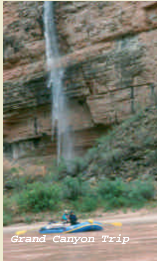
Grand Canyon Trip