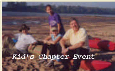
Kid's Chapter Event