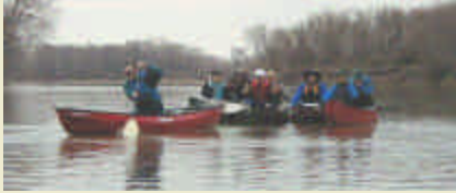
Kayak Chapter Trip