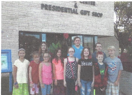
4th-8th Graders (both photos)