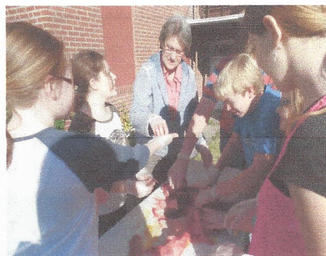
6th-8th Look Through a Pig Pluck

When we think of pigs, we often think of food, but pigs can be used for good things like organ transplants; people have had pig organ transplants. Their genetic makeup is very similar to ours. Did you know that relative to their body size pigs have small lungs, unlike us? Pigs help us in many different ways.