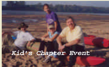
Kid's Chapter Event